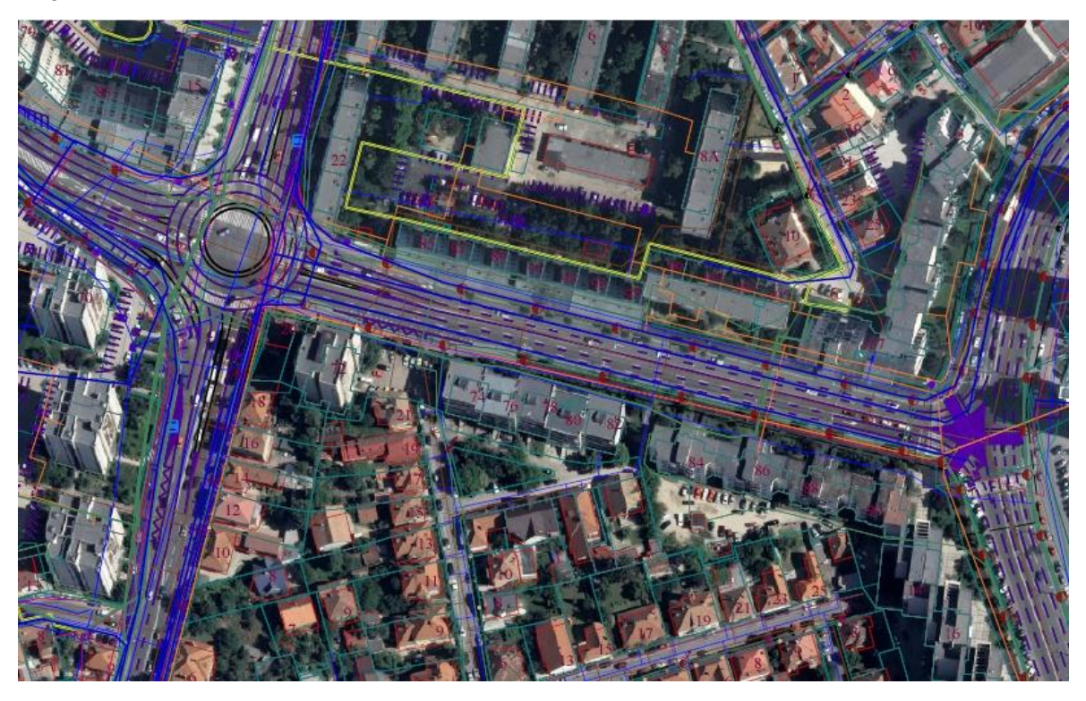
Figure 2. Vector digital map interface

The automating approval of the public interventions in order to correct different network utilities failures constitutes the greatest benefit. Applications for issuing the paperwork will be completed online, along with all the necessary information for the city hall to track the incident, including geographical location of it. Positioning the incident will be done in a vector digital map interface type (Figure 2).